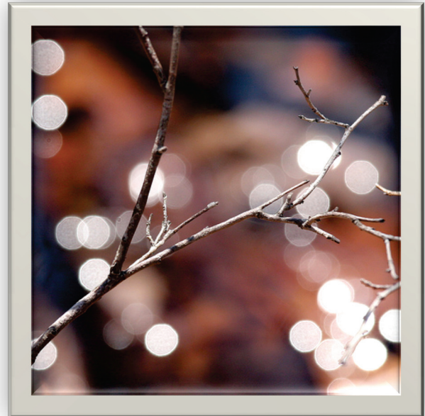
Photo courtesy of Flickr Creative Commons. Swamp Bokeh by Dawn Huczek, 2009.

202.339.6273 | nfranklin@rtcrm.com | Sparkblog: rtcrm.com/blog/ | Twitter: @rtcrm | SlideShare.net/rtc123